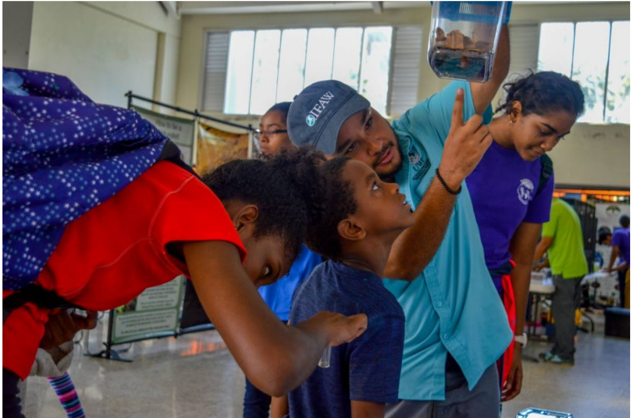
The public is invited to join us on November 18 for demonstrations and nature walks.

Due to habitat loss and poaching, the opportunity to see this majestic source of national pride in the wild is dwindling, so the Bioblitz is a great opportunity to visit the Pawi in nearby villages. In addition to the Pawi, the north east offers a plethora of unique plant and animal experiences.