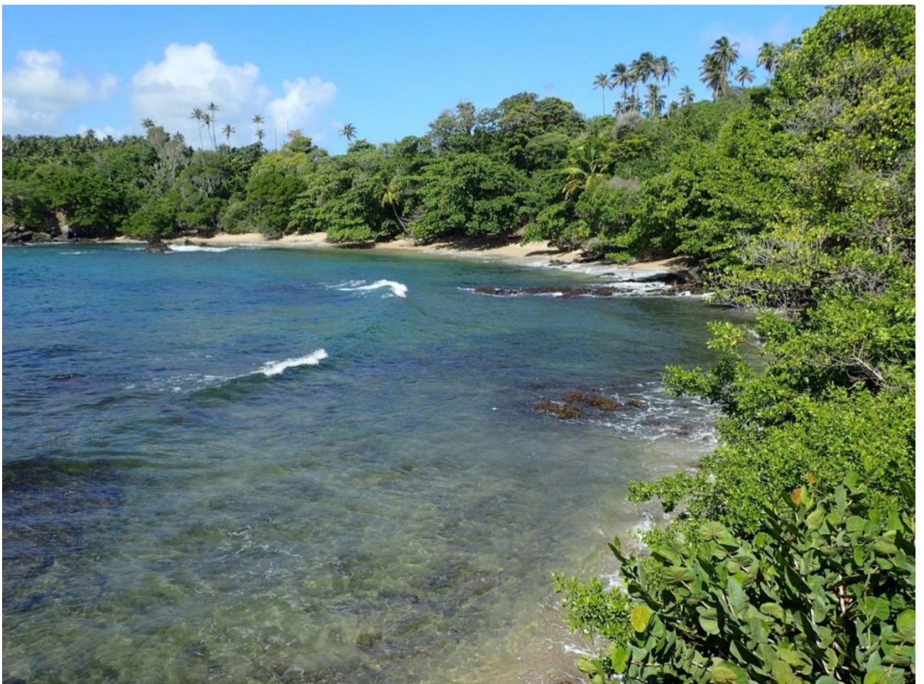
Toco is home to a variety of ecosystems – from shallow reefs to forest.

This year's Bioblitz is special because of Toco's imminent development for expansion of the east-west highway and establishment of an east coast port. The Sangre Grande area and surrounding habitats have already experienced dramatic and irreversible habitat alteration due to the highway expansion, so the Bioblitz sampling in Toco will allow the documentation of the local flora and fauna before it is also dramatically altered. Bioblitz reports are publicly available for the use of anyone interested in the conservation of biodiversity or the care for developmental planning in the Toco area.