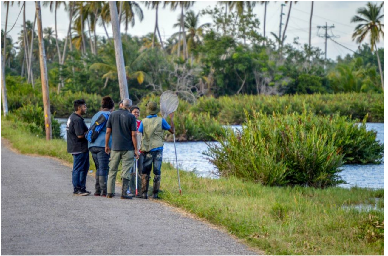
A survey team preparing to go to work at last year's Bioblitz in Icacos.

Sampling will continue through the evening and will stop at noon on Sunday, at which point a master species list will be compiled. While the naturalists are collecting samples and tallying their lists, instructors from the Field Naturalists' Club, UWI Zoology Museum, and the Serpentarium will be at base camp from 7 am to 2 pm, on Sunday, to do demonstrations and lead short nature walks for the public. The main event of the Bioblitz is the announcement of the total number of species detected, which occurs around 1 pm on Sunday.